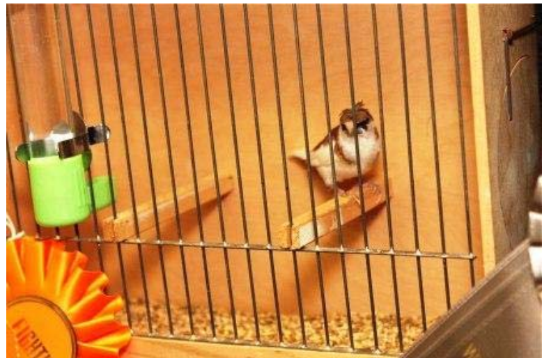
Lily Curd's winning bird crested society